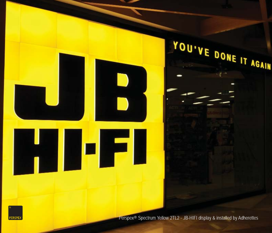
Perspex® Spectrum Yellow 2TL2 - JB-HIFI display & installed by Adherettes