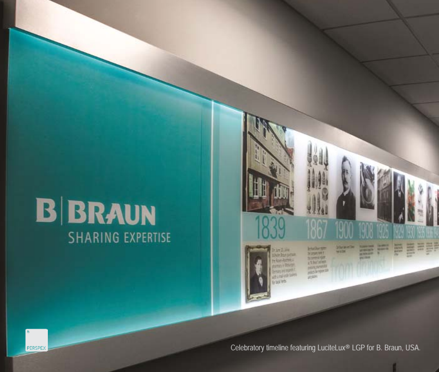
Celebratory timeline featuring LuciteLux® LGP for B. Braun, USA.