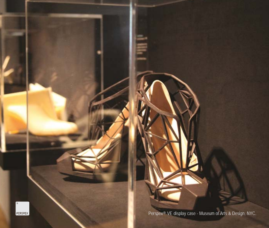
Perspex® VE display case - Museum of Arts & Design, NYC.