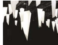
< Triangular Series by Jamie Zigelbaum featured at Design Miami/Basel.

Create slimmer, brighter, more cost-effective back lit signs and other applications that perform in all weathers using our Perspex® Spectrum sheet, which is infused with diffusion particles that help deliver vibrant, constant colour and exceptional even brightness. Perspex® Spectrum acrylic colours have been specially formulated to give optimised colour performance with both transmitted and reflected light using white LEDs. Adding enhanced colour to signage applications while eliminating 'hotspots'.