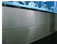
< AllFrost® Door 55 Slimline with Platinum 9PY2 (see page 20)

Perspex® Pearlescent is a single sided product that uses light and shade to great effect as the light is reflected from the surface at different angles meaning that virtually every POS display crafted from Perspex® Pearlescent could be considered unique!